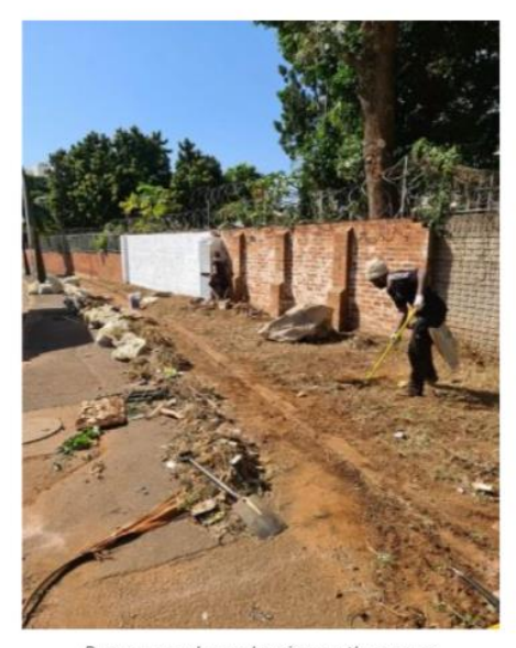
Progress made on cleaning up the corner.

"The UIP is on a 'rampage' and is taking back its public spaces in phase two of our development. The first phase was setting up, and now we are identifying spaces in the area for beautification. In our endeavours, we have appointed people to help with our projects," said Stokes.